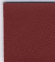
PR 47 Tapestry Red