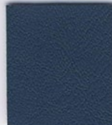
PR 54 Mallard Blue