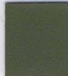
PR 53 Ivy