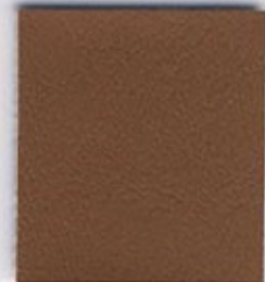
PR 52 Saddle