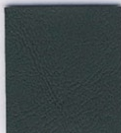
PR 49 Deep Sea