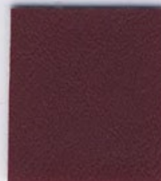
PR 41 Mulberry