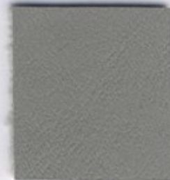
PR 37 Feather