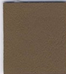
PR 43 Velvet Brown