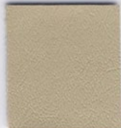
PR 35 Fawn