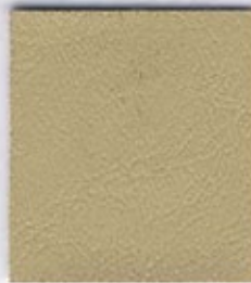
PR 48 Doeskin