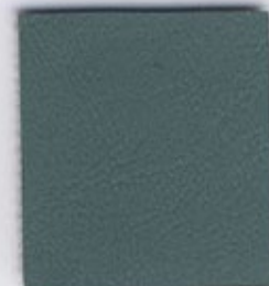
PR 45 Mint Leaf