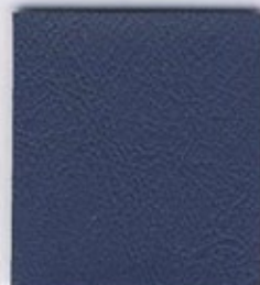
PR 50 Lake Louise