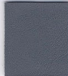
PR 46 Blue Fog