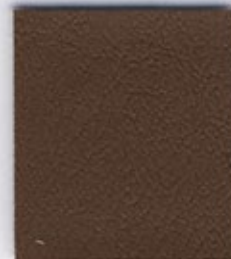
PR 38 Harness