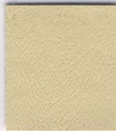
PR 44 Cream