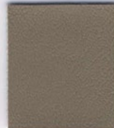
PR 51 Cocoa