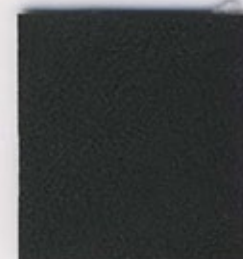
PR 40 Black Satin