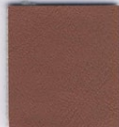
PR 42 Rose Blush