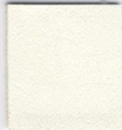
PR 34 Soft White