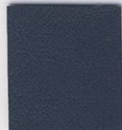
PR 55 Deep Sapphire