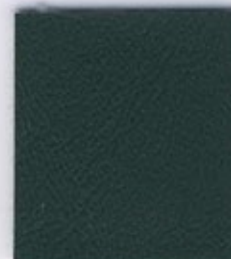
PR 39 Laurel