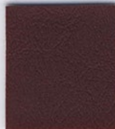
PR 36 Cabernet