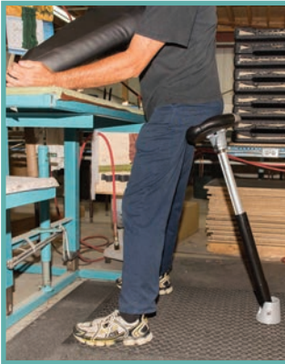
Upholstery multi-task station

The Posiflex UpRight stand stool is designed to enhance comfort and allows ease of movements when workers are standing in a near stationary position.